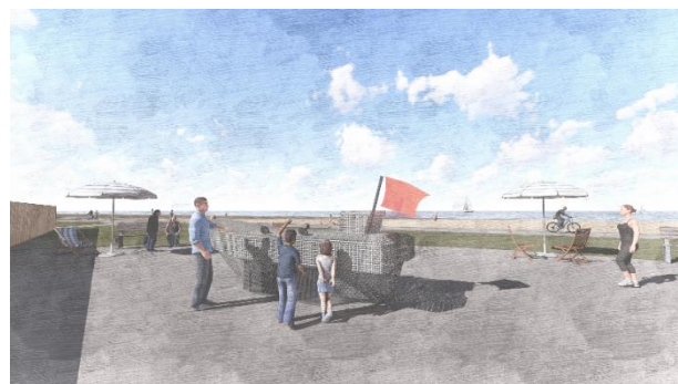
Hemsby, land adjacent to Beach Café – Bottleship: Sea Weaver