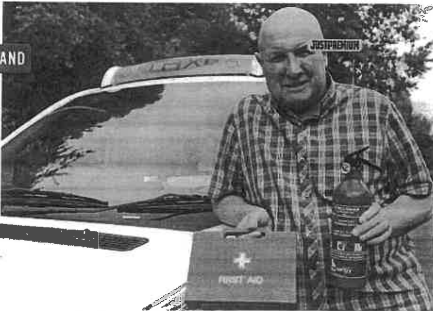
Taxi drivers no longer have to carry first aid kits or fire extinguishers