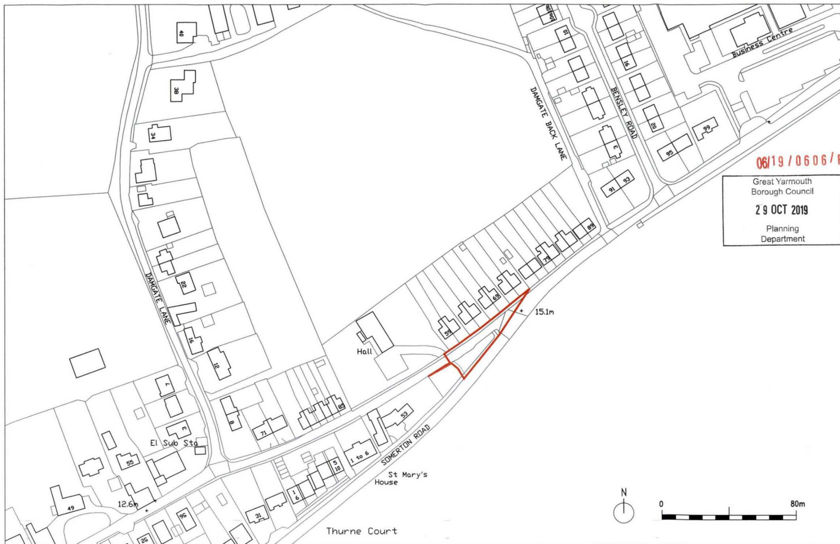
LOCATION PLAN 1:1250 @ A3