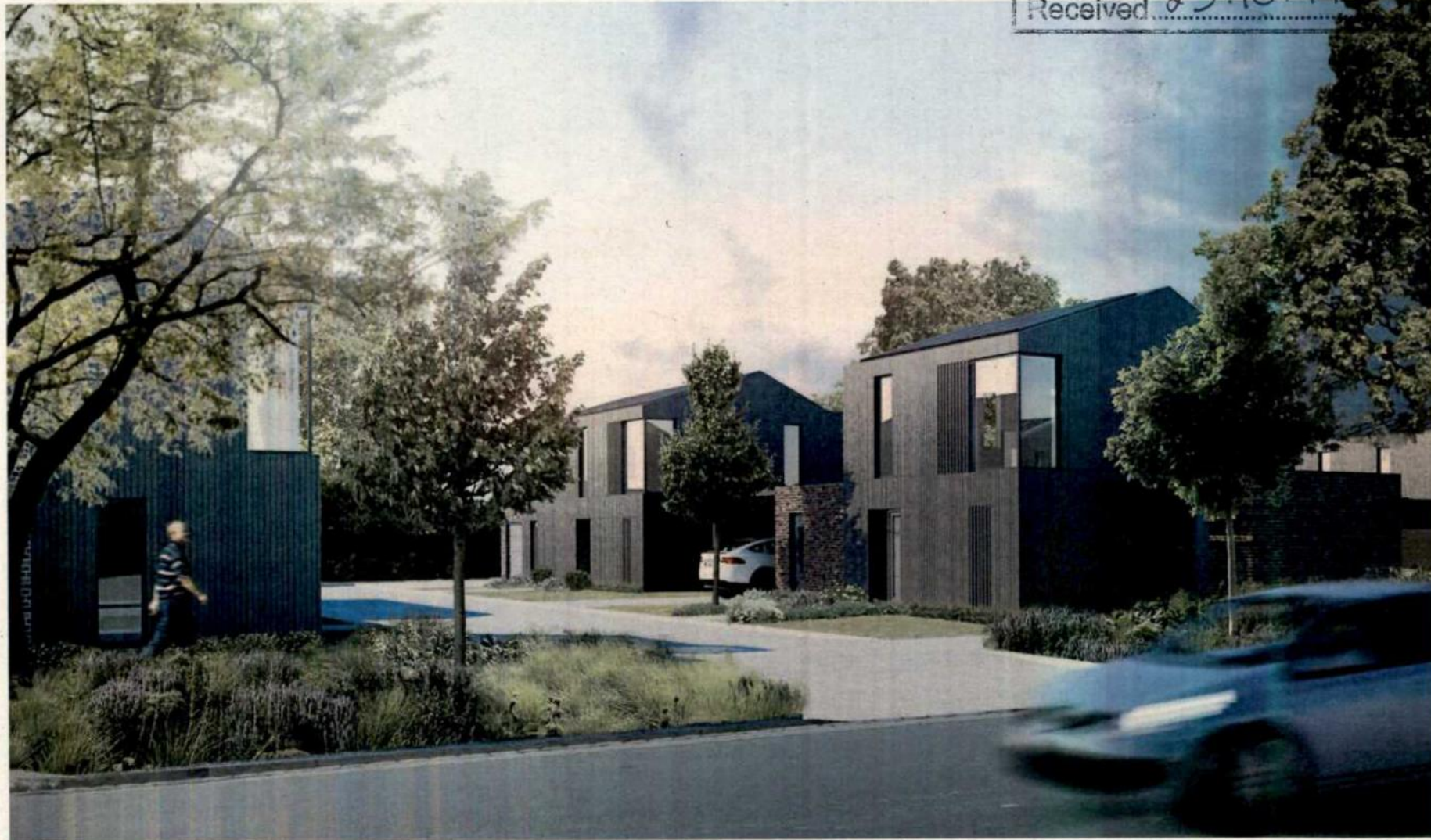
Plots 6&7 (Type B1/D1)

App. No. 06/19/0071/5 REVISED PLAN Received 25.10.19