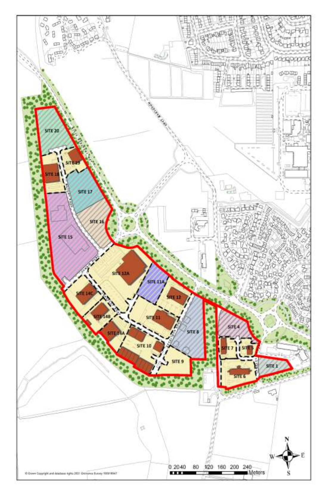
Figure 1 - Masterplan