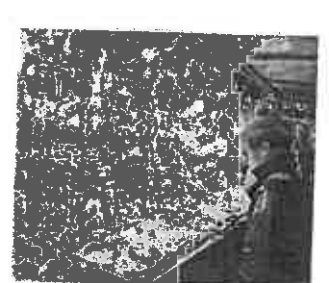
How Small Businesses Should Prepare for the Busiest Shopping Period