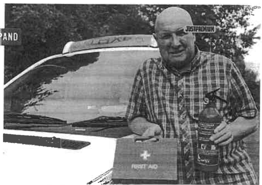
Taxi drivers no longer have to carry first aid kits or fire extinguishers