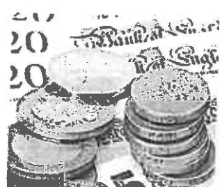
New Policy in the UK: Simple Trick to Save Your Family Thousands